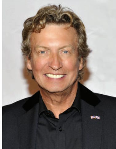
NIGEL LYTHGOE, OBE

This will be a high profile event with substantial press coverage in Southern California and the UK. A Sponsorship of the afternoon will promote products and services to a broad audience of decision-makers across industries.