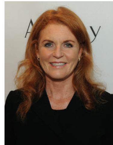
SARAH, DUCHESS OF YORK